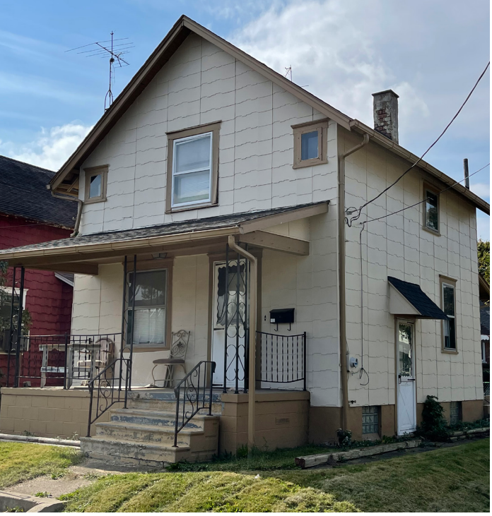
Auction #1: 2222 17th St. NE, Canton, OH 44705

Auction #2: 1657 Edwards Ave. NE, Canton, OH 44705